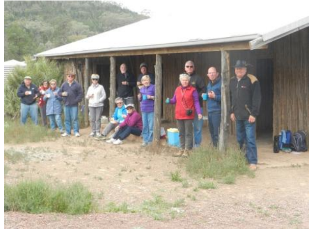
Aroona Valley area