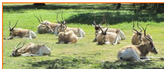
AA Happy Hour