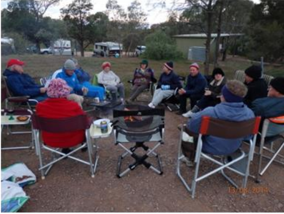
Rugged up around the Camp Fire at Rawnsley Park