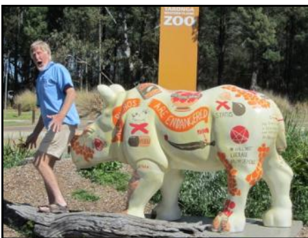
A little to the left please!!

The final night was held in Casillis where HH was delayed until the Bowling Club opened for 2 hours at 5pm: I tell you we were both gasping by that time. It's a funny little place with room for 15 powered van but the power points are found in the most unlikely places: well worth a night if you happen to be passing. On leaving the driver wanted to turn left but the host had other plans and in turning right we missed out on seeing the town.