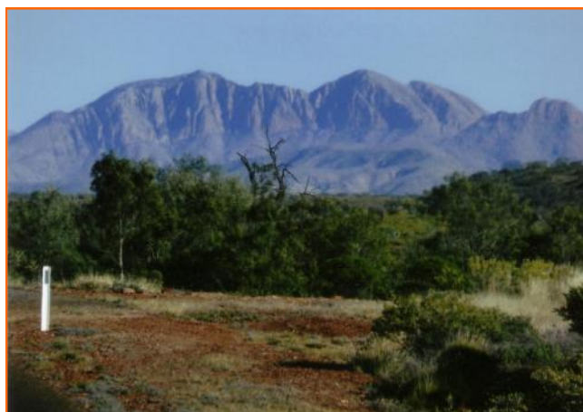
West MacDonnell Ranges —spectacular