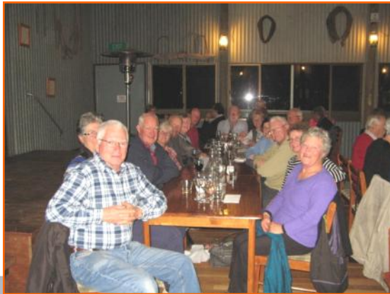
Woolshed Restaurant dinner