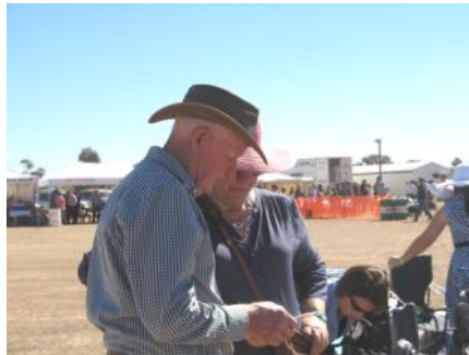
At the Louth Races