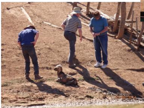
The rescued goat