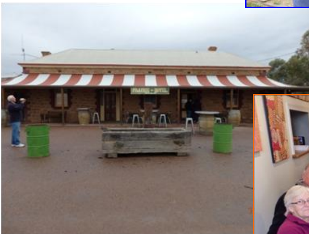
Parachilna—the Prairie Hotel lunch