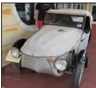
Mini Avan tow-er